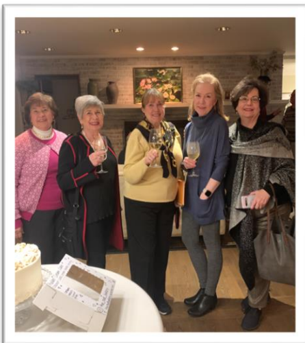
Le belle signore!